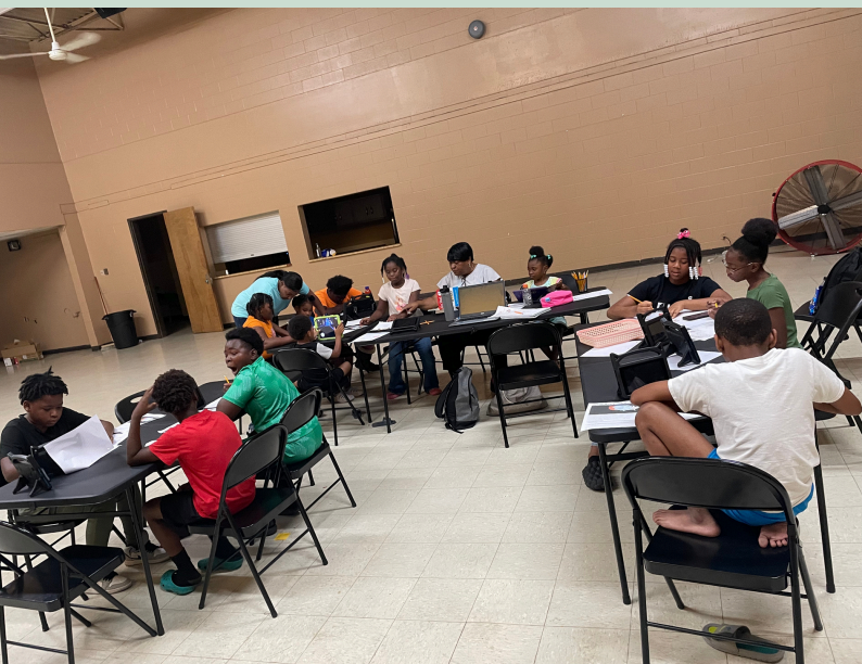
Summer Initiative in Elaine