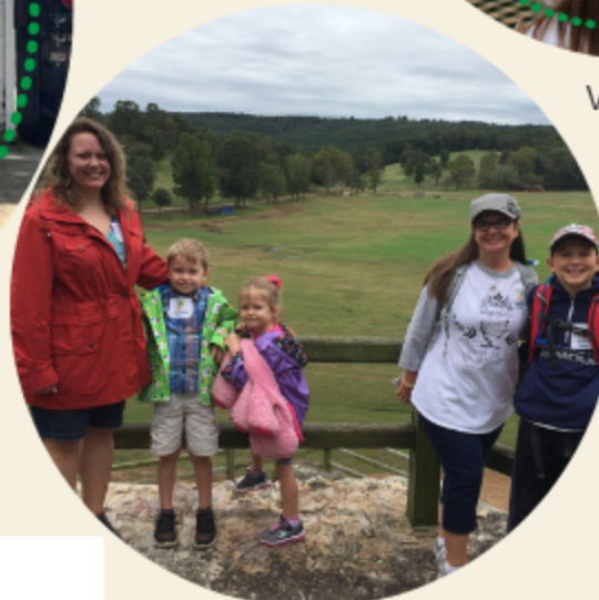
Van Buren County