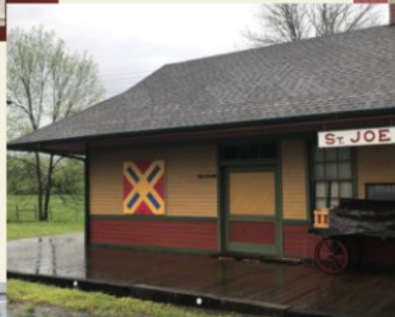
#2-09 At The Depot quilt block at the restored St. Joe Train Depot at 110 US Highway 65, St. Joe, AR.