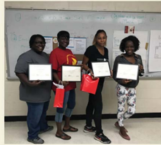
Fall 2018- PMPs after completing training in Eudora (right) and attending the last Arkansas Campaign for Grade Level Reading CSI convening (left).

Parent mentors complete a 15-hour training and are then assigned a classroom where they are mentored by a teacher on how to work one-on-one and in small groups with children. Parent mentors serve in the classroom Monday-Thursday for 2 hours per day and participate in ongoing training on Friday mornings. After successfully completing their term, parent mentors receive a modest stipend.