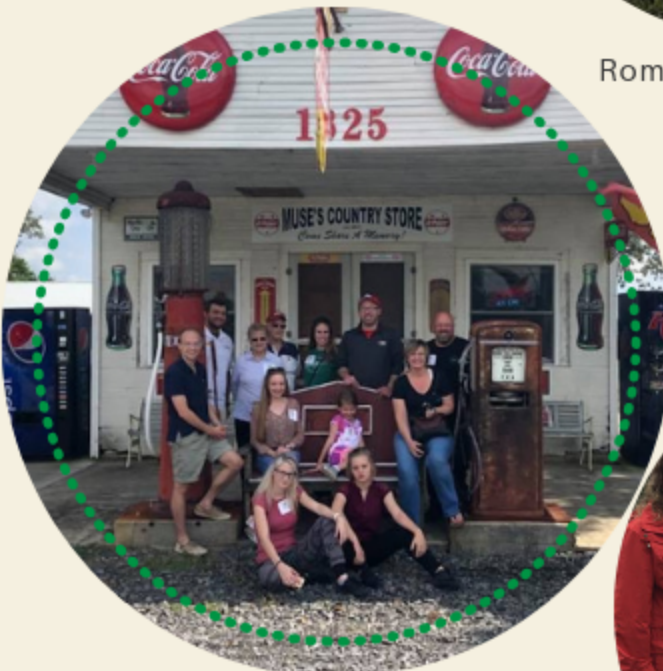
Muse's Country Store in Heber Springs