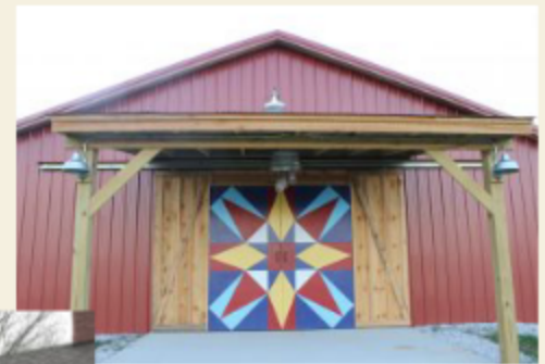
#1-05 Front Porch Memories at 12585 Highway 9, Mountain View, AR doubles as the barn doors at Sugar Hill Ranch.