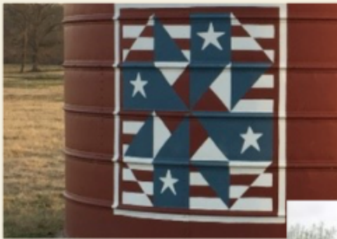
#4-06 Patriotic Pinwheel at 3109 highway 60 West, Perryville, AR.