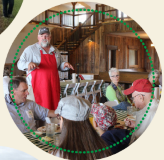
Van Buren County