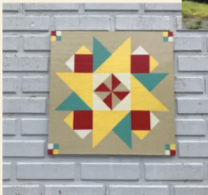
#3-07 Pinwheel quilt block at 245 Main Street, Clinton AR in the historic downtown.