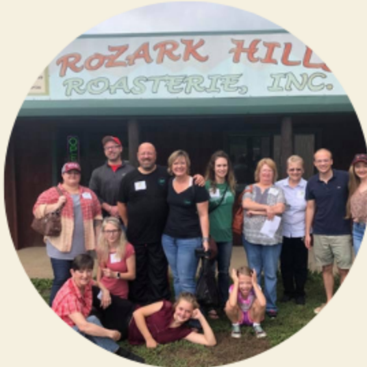
RoZark Hills Coffee Roasterie in Rose Bud