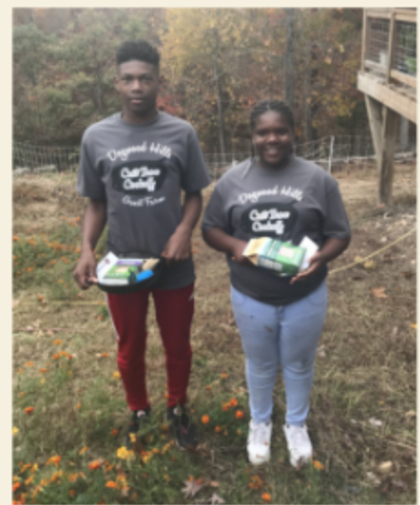
Two Youth Network members placed in the statewide Cast Iron Cookoff

Throughout the year, the Youth Network members were engaged with the Annual Conference and the Cast Iron Cookoff, which was held regionally and culminated to a statewide event at Dogwood Farms where two Youth Network members placed in the competition.