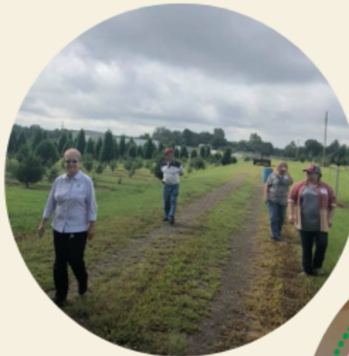
Romance Christmas Tree Farm