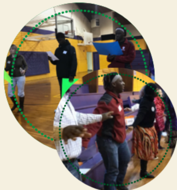
Youth Network Summit 2018