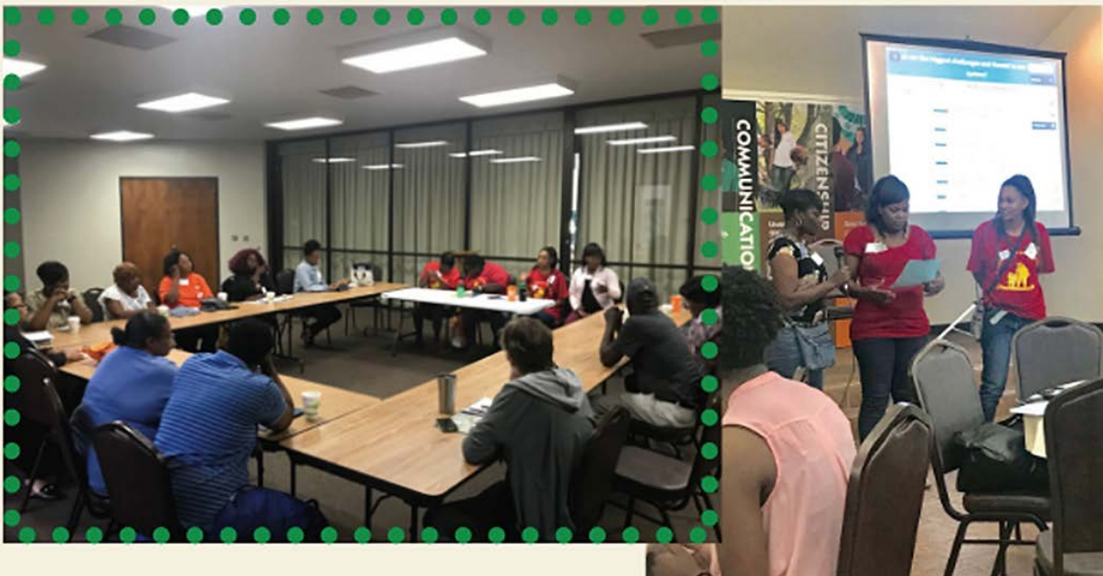
PMPs presenting at the Arkansas Opportunity to Learn Campaign summit .

Parent mentors complete a 15-hour training and are then assigned a classroom where they are mentored by a teacher on how to work one-on-one and in small groups with children. Parent mentors serve in the classroom Monday-Thursday for 2 hours per day and participate in ongoing training on Friday mornings. After successfully completing their term, parent mentors receive a modest stipend.