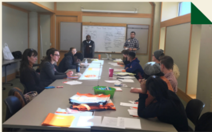
Inaugural Youth Leadership Council meeting